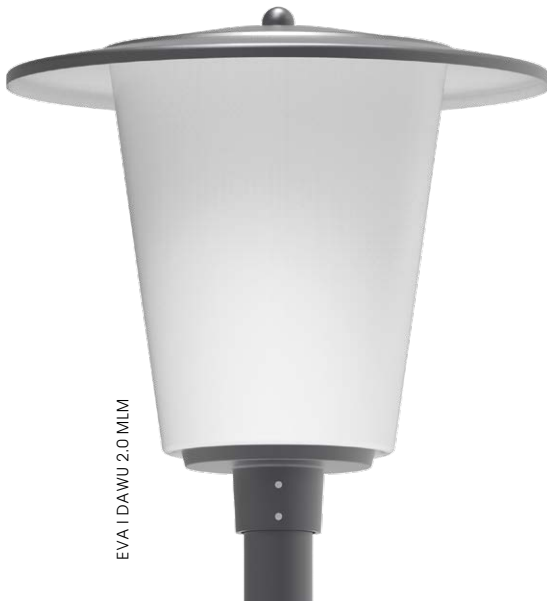
EVA I DAWU 2.0 MLM