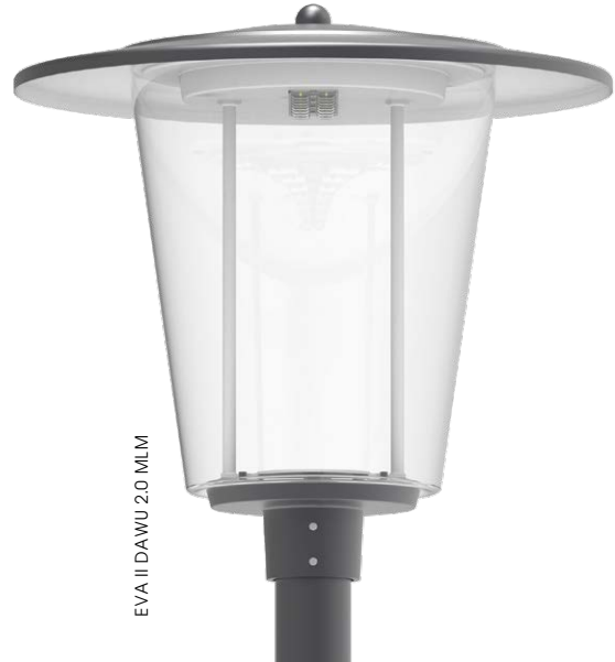
EVA II DAWU 2.0 MLM

MASTAUFSATZLEUCHE | WANDLEUCHE POST TOP LUMINAIRE | WALL LUMINAIRE