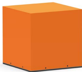
foil colour: traffic orange